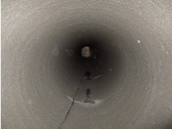
Circular channel after lining completion