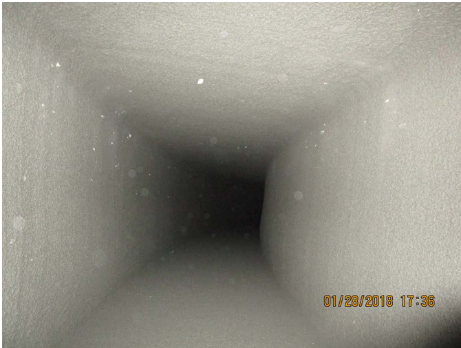
Radiused rectangular channel after lining completion