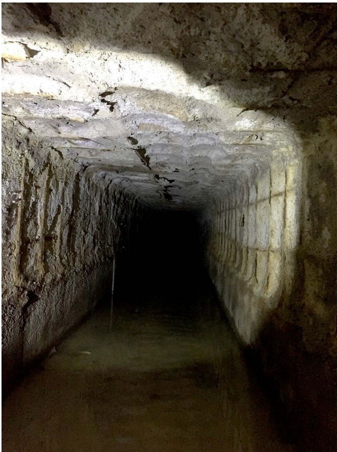
Rectangular channel prior to lining

This project required continual and constant coordination between the team consisting of City of Omaha staff, the contractor and Schemmer. The City was responsible for adjusting the processes at the facility in order to take the construction areas offline and allow the contractor access. Strict scheduling, open communication and fast turnarounds were necessary to avoid delays to the project and keep plant operations running smoothly.