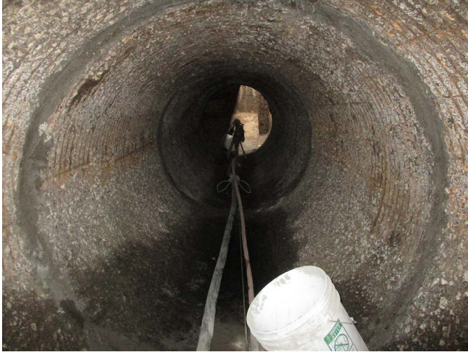
Circular channel prior to lining