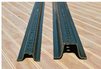
U-Channel Support Post