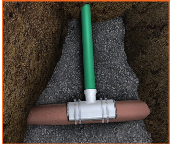
LMK SADDLE SYSTEM