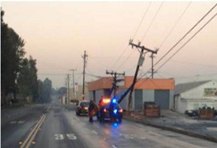
A drunk driver knocked down two power poles.

PROTECTING THE PACIFIC OCEAN WAS CRITICAL; REAL-TIME MONITORING COMBINED WITH QUICK RESPONSE AVOIDED CATASTROPHIC OUTCOME