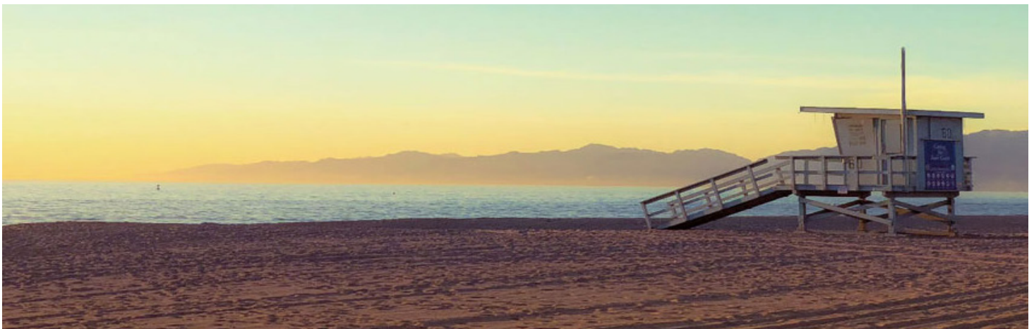
Rapid action protected the environment at El Segundo Beach